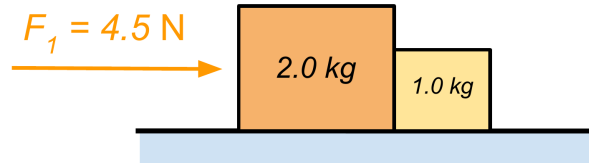
Figure 1: Diagram for Question 1.

Two blocks with masses 2.0 kg and 1.0 kg lie on a frictionless table. A force of 4.5 N is applied as shown in figure 1. What is the normal force between the blocks?